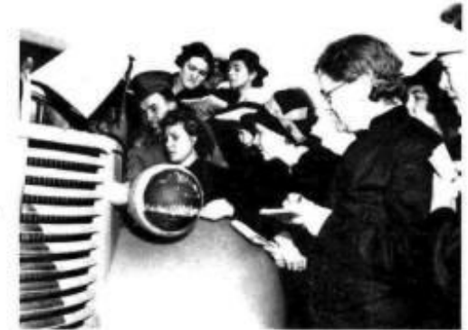
JOL-SLQ Image 17205

Find at least two other jobs mentioned in the displays. List them here: