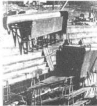
Queensland Maritime Museum