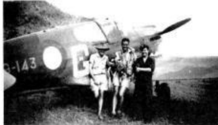
JOL 8LQ Image 188156

Use the photos in the display to identify this plane. Then write a caption for the picture